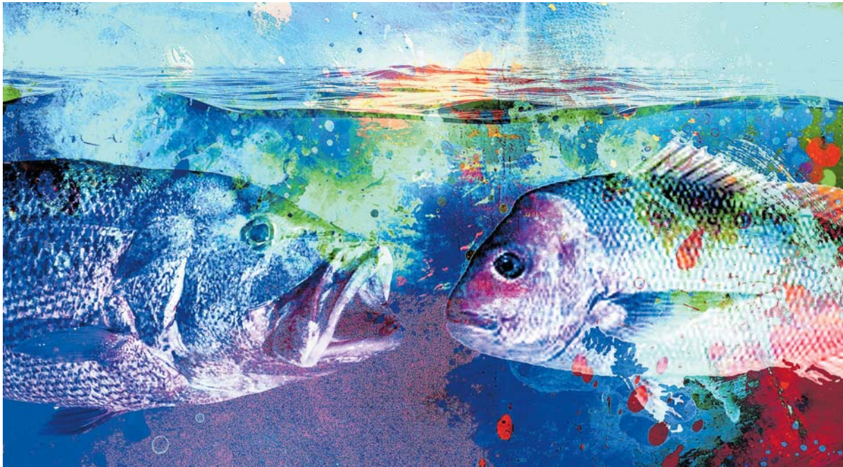
The Cook Government’s demersal reforms benefit the few. Illustration: Don Lindsay

When you start swimming with the Greens, don’t be surprised when they decide you’re the next bycatch.